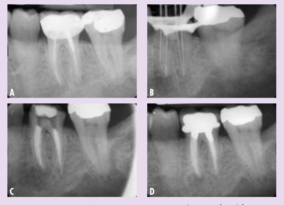
IGURES 11A-D—BLOCKAGE, SEALING AND FOLLOW-UP A) Tooth #36, referred for retreatment, with a fragment noted at the apex of the mesikal root. A small piece of instrument also noted beyond the apex, withing the lesion of the mesial root. B) Trial file film, showing the true blockage in the ML canal. C) Post Obturation film. D) Oneyear recal, lesion reduced in size, asymptomatic, tooth restored.

noted. Once some movement is seen, a second diamond coated zirconium tip, such as the CPR<sup>TM</sup> (Fig. 5D) (Spartan/ Obtura, Fenton, Missouri) (Fig. 6H), the UT-4-S<sup>TM</sup> or the SP-2-S<sup>TM</sup> (SybronEndo, Orange, CA) (Fig. 6I), can be applied with the tip activated once in contact with the metal fragment only.