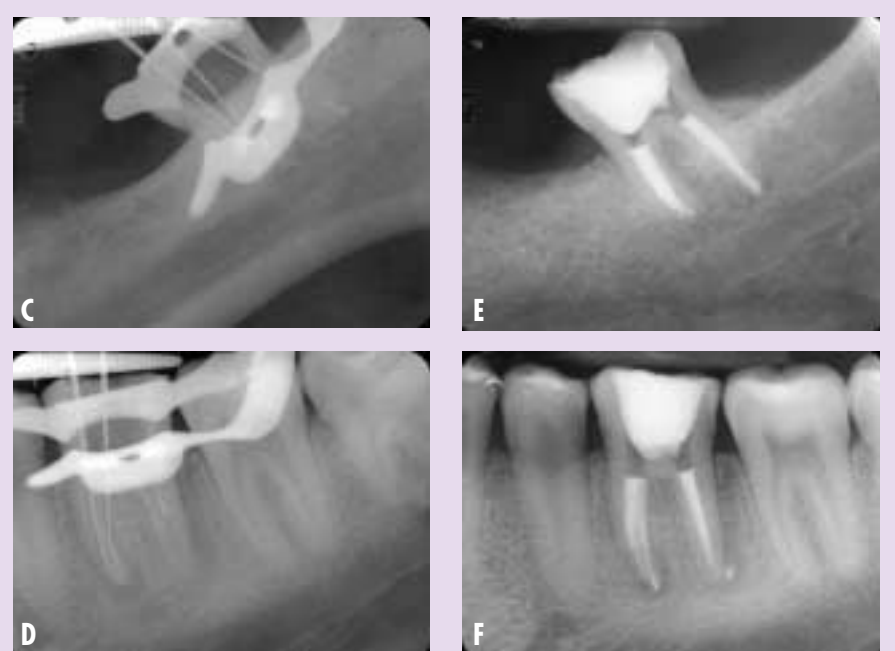
FIGURES 8A-G—THE "BOUNCE" A & B) Two mandibular molars, #36 and #37, with separated file fragments in the mesial roots, below the level of the curvature. C & D) After staging, ultrasonic energy was applied, alternating titanium and zirconium tips. The fragments "bounced" out of the mesial root, and landed in the distal canals of each tooth! E & F) The pieces were floated out of the distal canals (not binding there), and the cases were completed. G) Three month recall of the treatment on tooth #36.

Step 2: Troughing (Fig. 6) A selection of ultrasonic tips is