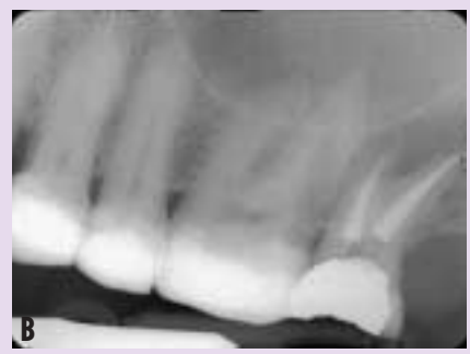
FIGURES 3A & B—DANGEROUS CURVES A) A two-rooted maxillary 2nd molar, tooth #27, with a separated file noted in the apical third of the buccal root. B) Obturation reveals the nature of the "S" curve in the apical third of this root.