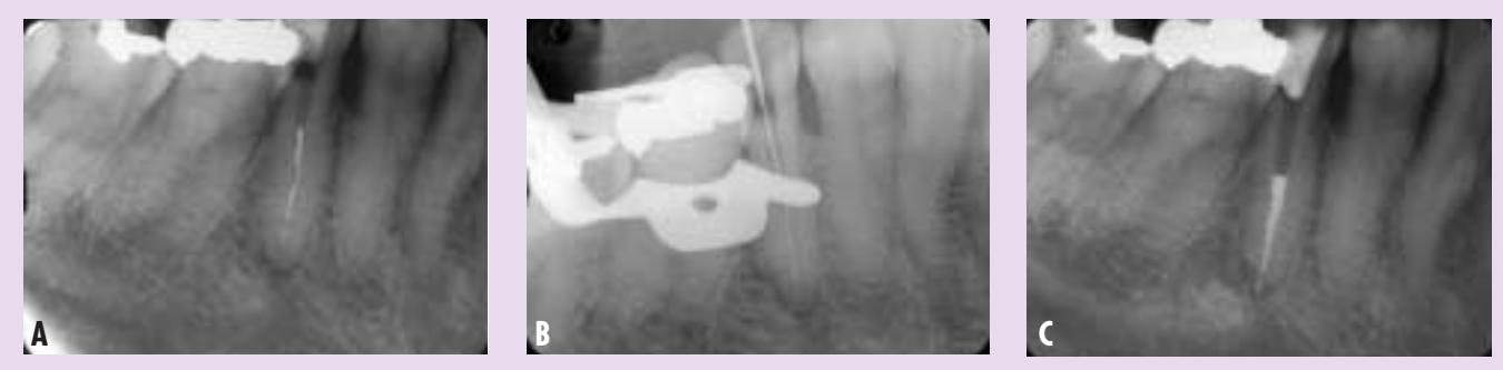
FIGURES 4A, B & C—DANGEROUS CURVES A) Four pieces of broken instrument noted in this mandibular bicuspid, tooth #45. B) Removal of three pieces, with the stubborn fourth piece stuck at the the apical third where the canal curves to the lingual. Trial file bypassed the last fragment. C) Bypass and sealing the fragment into place, around the apical curve.