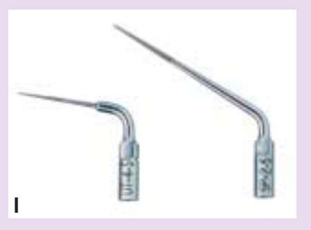
FIGURES 6G-K—ISOLATION, TOUGHTING AND RETRIEVAL G) CPR™ titanium tips (Spartan/Obtura, Fenton, MO). H) CPR™ diamond coated tips (Spartan/Obtura, Fenton, MO). I) UT-4-S™ and the SP-2-S™ (SybronEndo, Orange, CA). J) Mini Endo Ultrasonic Unit (SybronEndo, Orange, CA). K) Spartan-MTS Unit (Fenton, MO).