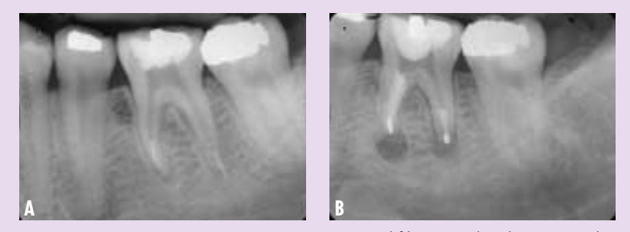
FIGURES 7A & B—SURGICAL RETRIEVAL A) Two separated files, apical to the curve in the mesial root, and part way through the apical constriction in the distal root. B) The canals were treated conventionally first, then apical surgery was performed at the same appointment to remove these fragments and seal the apices.

stress and fatigue and therefore preventing fracture.